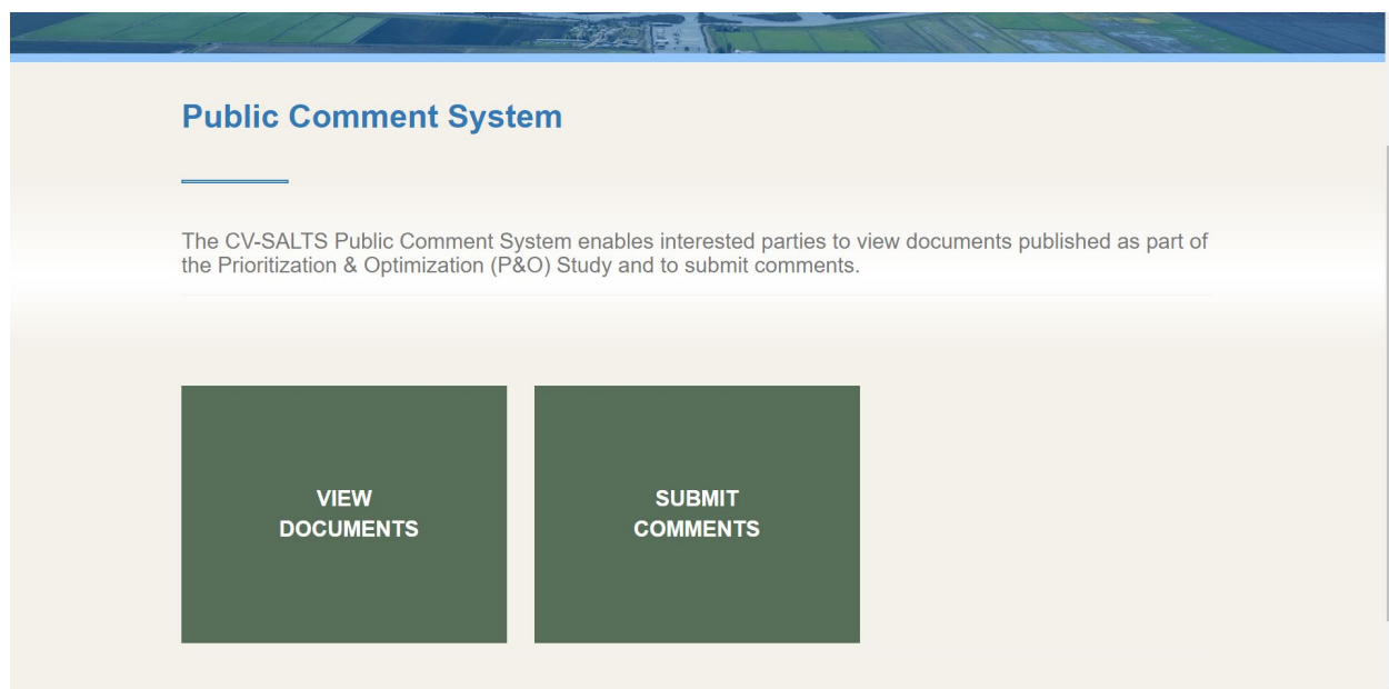
Figure 1. Public Comment System Home

A view of the Public Comment System home page is shown below (Figure 1).